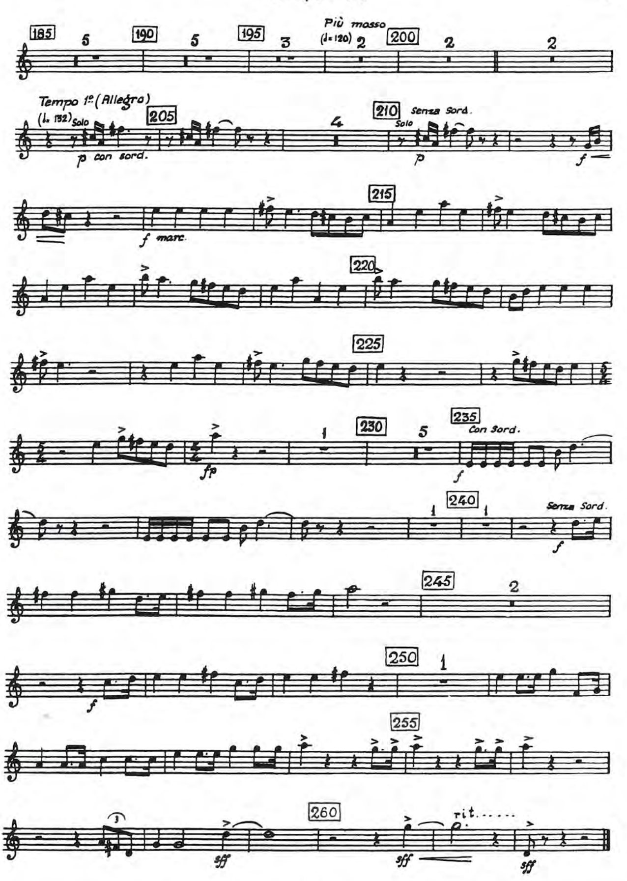
B. H. 8464