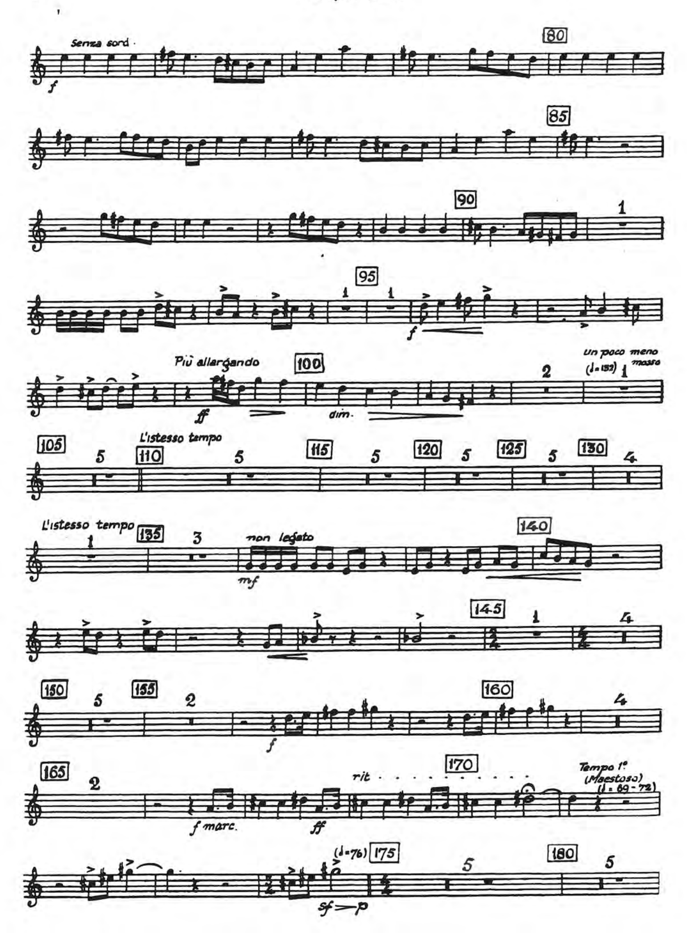
B& H. 8464