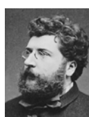
Georges Bizet 1838–1875