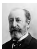
Camille Saint-Saëns 1835–1921